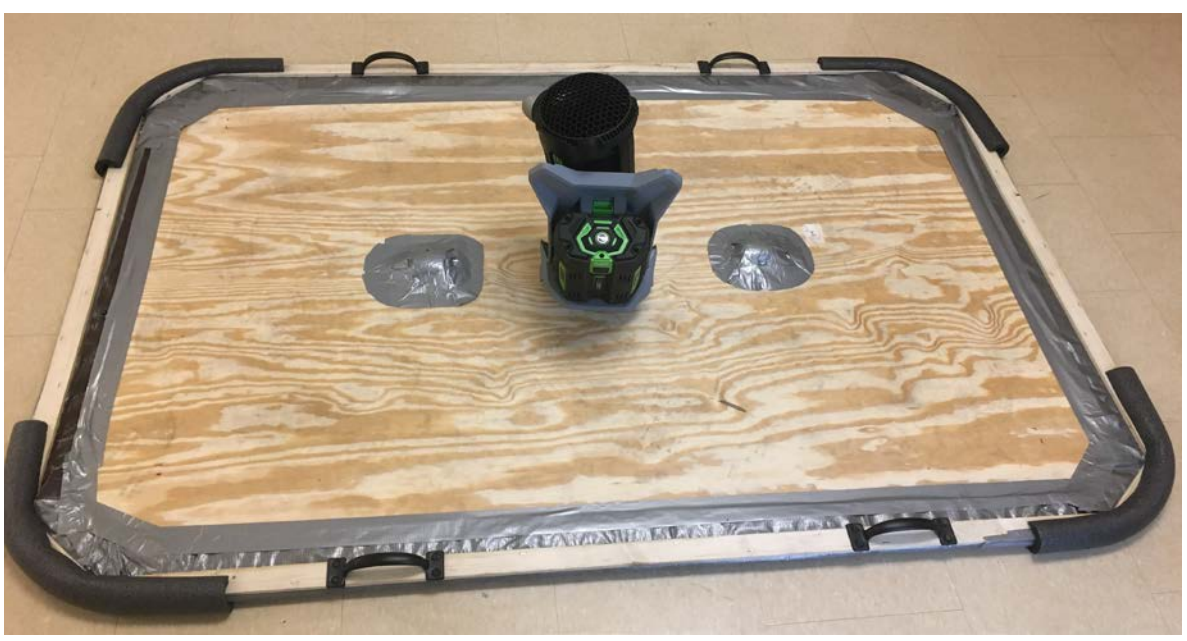
The completed big hovercraft! Photo by Anna Murphree.

Joe McPherson, one of our machine shop teachers, testing out the big hovercraft. Photo by Anna Murphree.