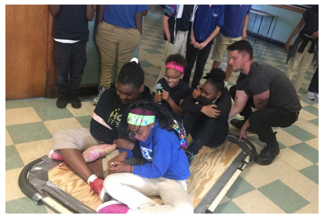
Students being surprised by how powerful the leaf blower was!