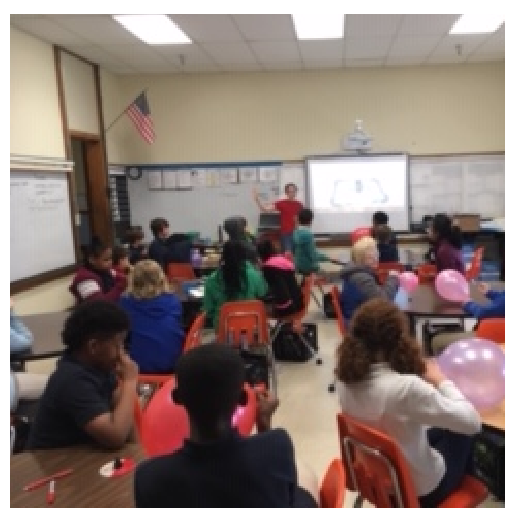
ncy, pressure, and hovercrafts.