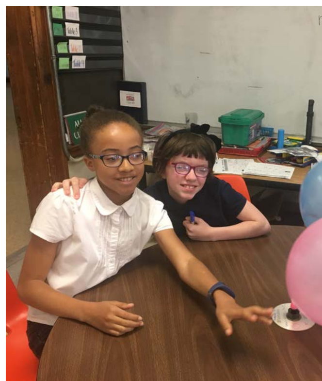
Happy 5th graders posing with their hovercrafts! Photo by Anna Murphree.

A cool rocket design on one student's hovercraft! Photo by Anna Murphree.