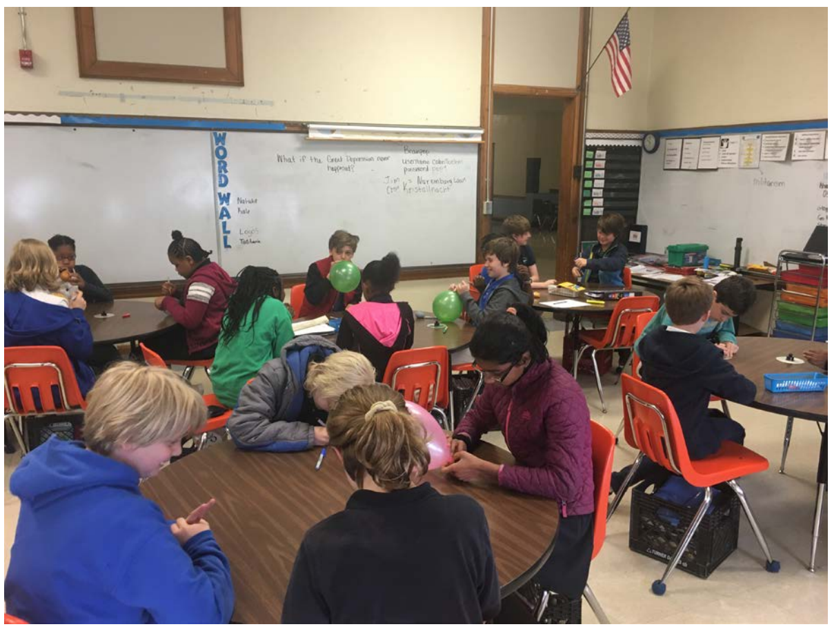
Students decorating and assembling their own hovercrafts!