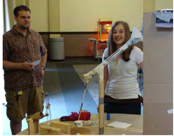
Students prepare their machines before the judges arrive