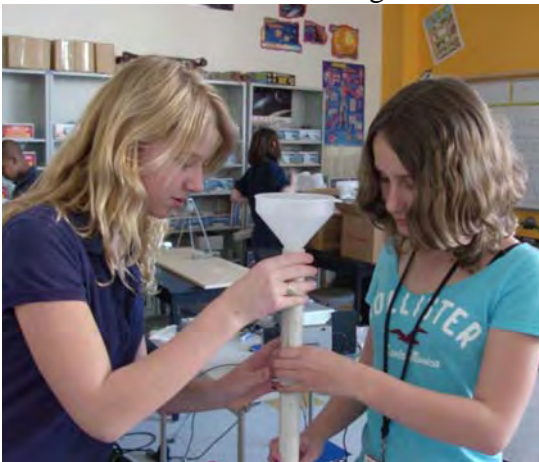
ICS students work on building their Rube Goldberg machines.