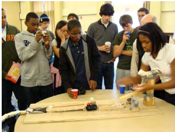
A demonstration of a Rube Goldberg for Drexel students and a judge