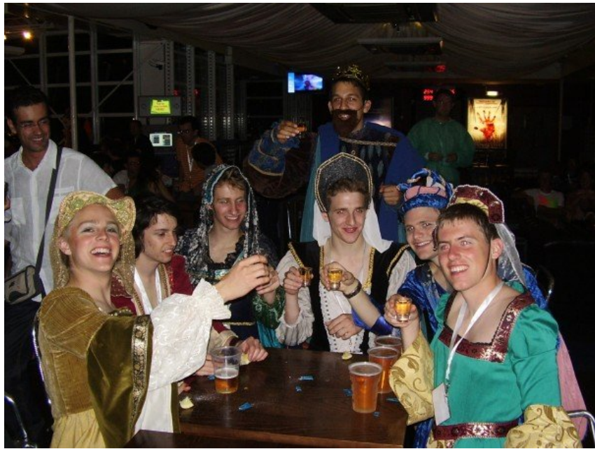
At the custom party- students from Sheffield.