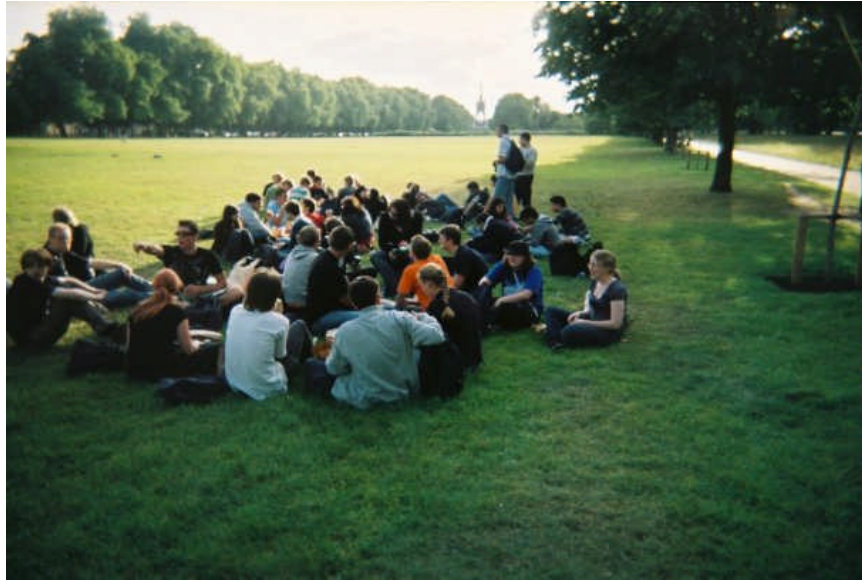
At Hyde Park – Students talking and mingling. It was quality time for students to get to know each other.