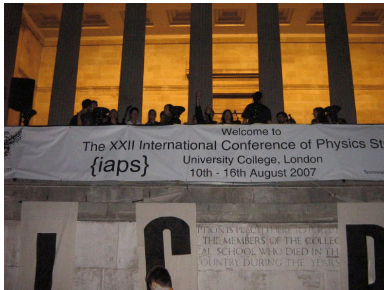
At the 22 nd ICPS National Party held in UCL, London from 10 th to 16 th of August, 2007 where some members of the conference performed.