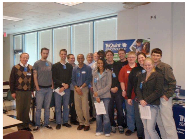
TriQuint Semiconductor tour: Demonstrations in the failure analysis lab (left), group photo in conference room (right).