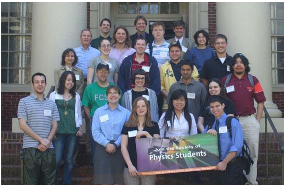
SPS Zone 4 Meeting attendees at Randolph College

The Society of Physics Students Zone 4 Meeting was held at Randolph College on April 17-18, 2009. Thirty attendees from Maryland and Virginia converged on campus for eleven student presenters, four invited speakers, Physics Jeopardy, field trips to the observatory and the seismograph, good food, good company, and a run on the Human-Sized Hamster Wheel.