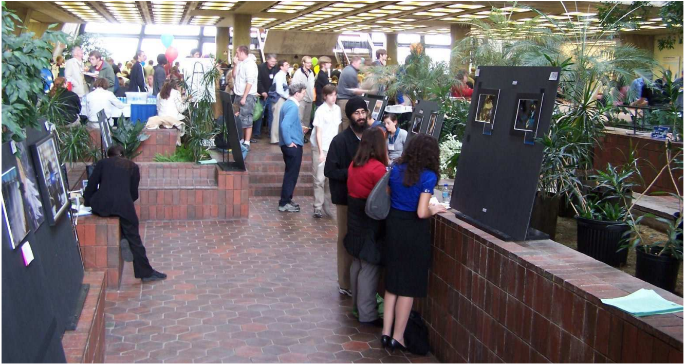
Above: The art contest in the atrium