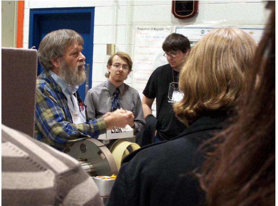
All: Tour of the Magnet Factory