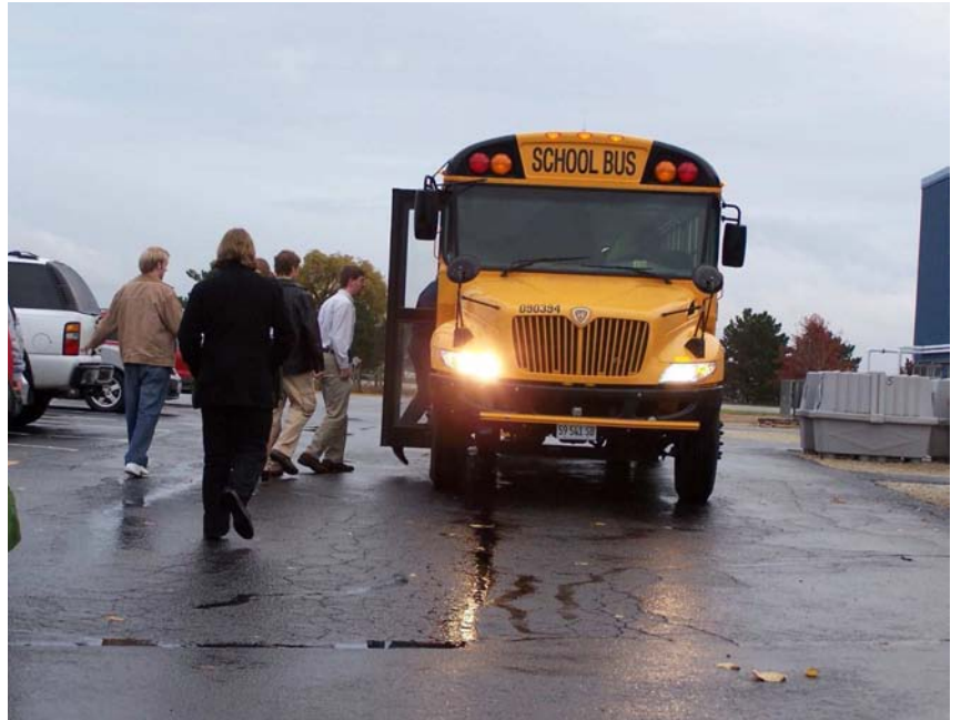
Above and above right: Out touring