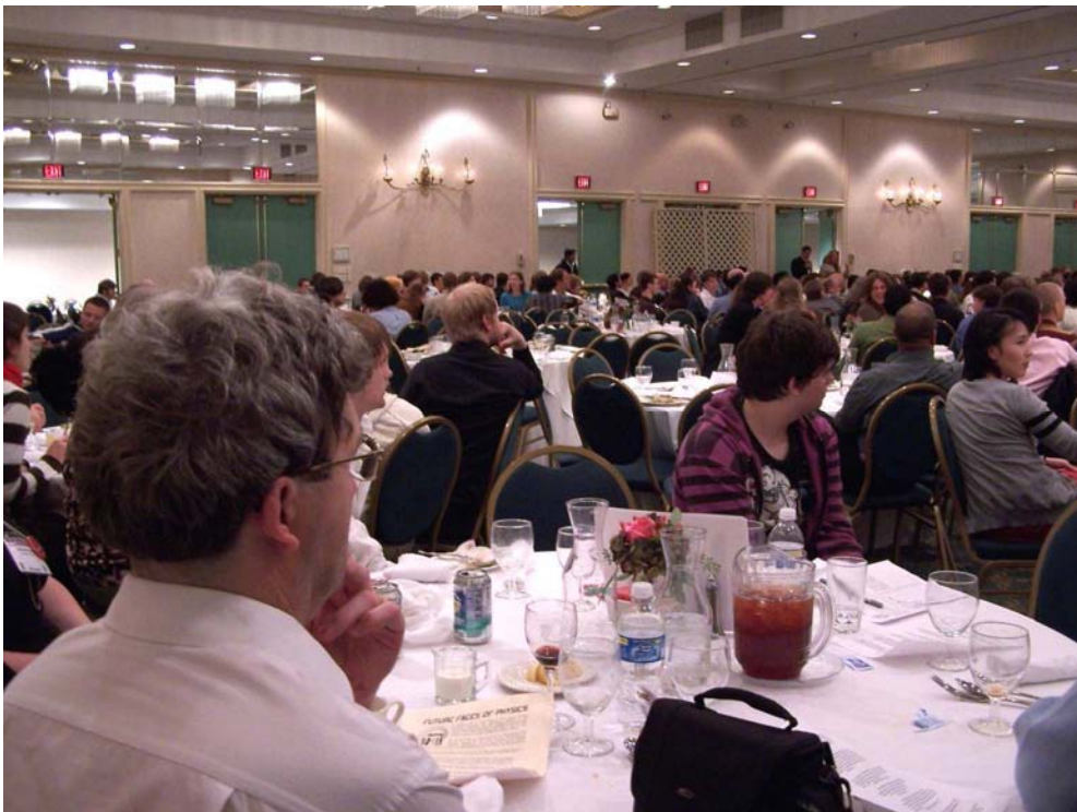
Below: Dinner and evening lecture at the hotel